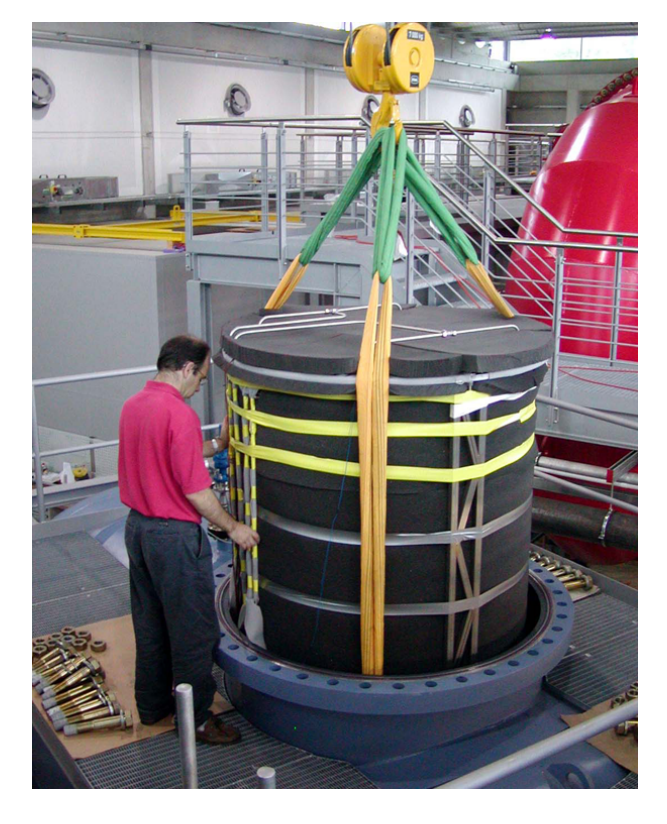
FIG. 4: The High-Pressure Convection Facility, weighing approximately 2000 kg, is being inserted into the turret of the "U-boat."

Using sulfur hexafluoride at 19 bars, we reached Ra \approx 2\times 10^{15}[44]. Up to Ra = 4\times 10^{13} our results were consistent with the Oregon experiment, but differed from the Grenoble measurements: we did not find the Kraichnan transition in Nu. At Ra = 4 \times 10^{13} we observed a sharp transition in Nu(Ra) to a new state, but the dependence of Nu(Ra) for this state was not as predicted by Kraichnan; we found an effective exponent that was less than 0.3 rather than the predicted 0.39 or so. Work with the HPCF is still under way, and we look forward to what the future will bring. We expect to learn quite a bit more about how the large-scale circulation evolves as Ra becomes large. However, at this point it is not clear whether the ultimate, or asymptotic, regime predicted by Kraichnan can ever be reached in a system with rigid top and bottom plates. But then the granules in the sun's photosphere for instance do not have any such confining plates.