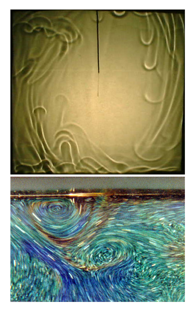
FIG. 2: (Top) Shadowgraph visualization of rising and falling plumes at Ra = 6.8 \times 10^8 , Pr = 596 (dipropylene glycol) in a \Gamma = 1 cell (from Ref. [11]). (Bottom) Small thermochromic liquid-crystal spheres are seeded in the convecting fluid. Their Bragg-scattered light changes color from red to blue in a narrow temperature range. Streak pictures of the spheres with a long exposure time show the temperature and velocity fields simultaneously. Cooler regions appear brown and warmer regions appear green and blue. This image was taken near the top surface at Ra = 2.6 \times 10^9 and Pr = 5.4 (water). The view shows an area of 6.5 cm by 4 cm. Near the middle top one sees a brownish (cold) plume detaching from the boundary layer, extending down and to the left into the fluid, and forming a mushroom head consisting of two swirls (from Ref. [12]).

azimuthal displacement \theta away from the mean value \theta_0 with two maxima, one each near the two displacement extrema. However, it turned out that p(\theta - \theta_0) was Gaussian distributed [21] with a maximum at \theta - \theta_0 = 0 . Such a distribution is indicative of a stochastically driven damped harmonic oscillator [22]. Thus both the azimuthal diffusion and the nature of the torsional mode suggest to us that we are dealing with a large-scale circulation of the system that is driven by the noise