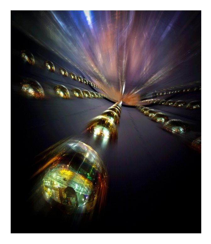
FIG. 2: The interior of one of the six antineutrino detectors at Daya Bay.

DOI: 10.1103/Physics.5.47 URL: http://link.aps.org/doi/10.1103/Physics.5.47