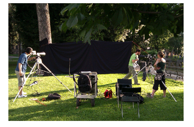
FIG. 1: Scientists capture video of swarming midges.

DOI: 10.1103/Physics.7.120 URL: http://link.aps.org/doi/10.1103/Physics.7.120