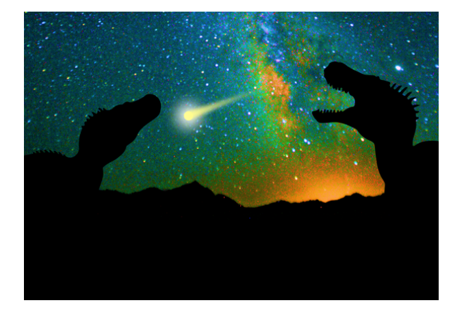
FIG. 1: Some large life-extinguishing impacts in our past may have been triggered by a dark matter disk in the Milky Way.

DOI: 10.1103/Physics.7.41 URL: http://link.aps.org/doi/10.1103/Physics.7.41