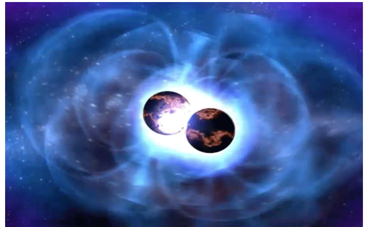
Video 1: (Animation appears online only.) Artistic animation of a binary neutron star merger resulting in a gamma-ray burst and emission of gravitational waves.

Radio surveys have now revealed roughly a dozen binary