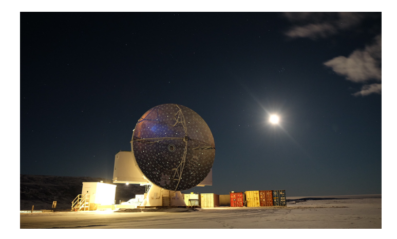
In 2018 the Greenland Telescope joined the EHT array.

orientations, but there are still significant gaps in the data. With an extra dish in the array, the team was able to fill in some of these gaps.